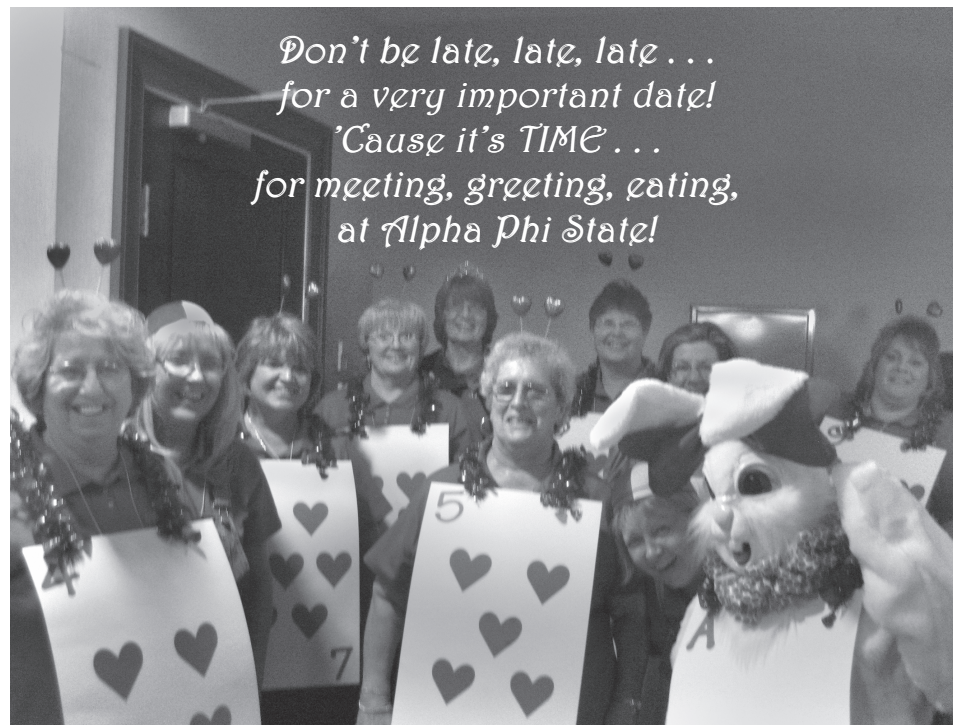
Alpha Nu and Theta sisters are using their TIME to prepare our 2011 Alpha Phi State Convention. They're thinking, planning, and working to make it entertaining, informative, and inspiring.

Don't be late, late, late . . . for a very important date! 'Cause it's TIME . . . for meeting, greeting, eating, at Alpha Phi State!